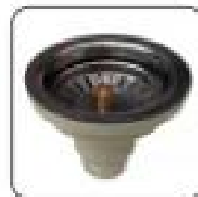
100 mm Waste Coupling